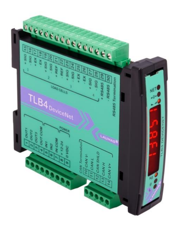
Figure 4 TLB4 indicator – sub model TLB4 DeviceNet.