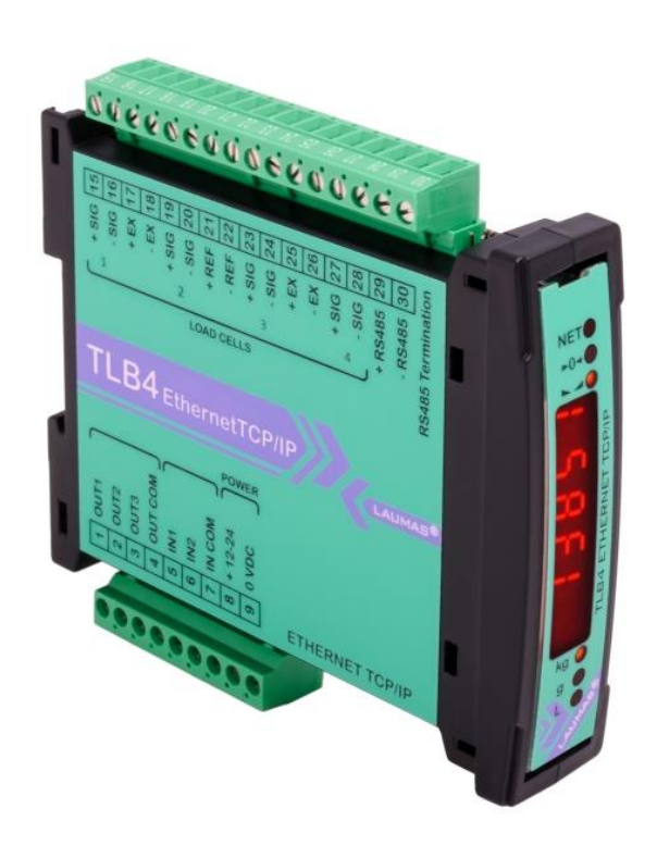
Figure 6 TLB4 indicator – sub model TLB4 EthernetTCP/IP