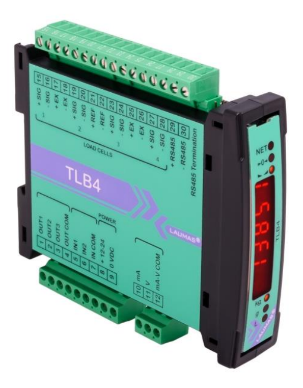
Figure 1 TLB4 indicator