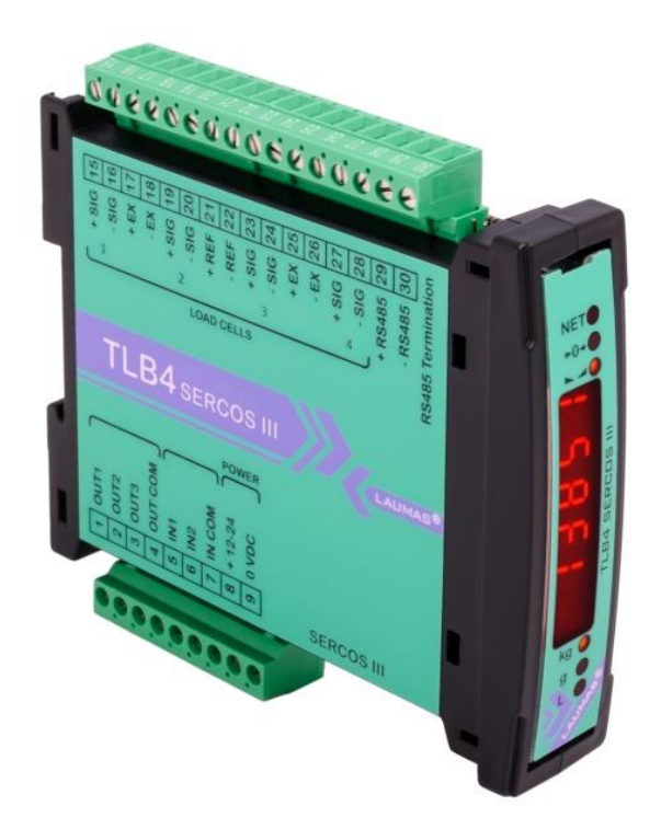
Figure 13 TLB4 indicator - sub model TLB4SERCOS III