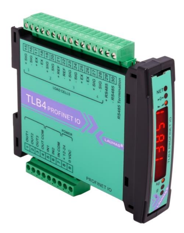
Figure 11 TLB4 indicator - sub model TLB4 PROFINET IO