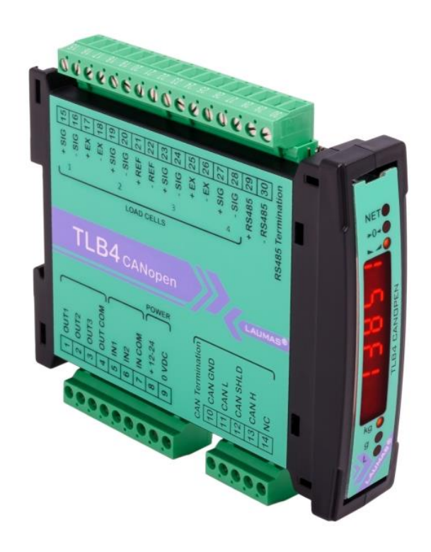
Figure 2 TLB4 indicator - sub model TLB4 CANopen