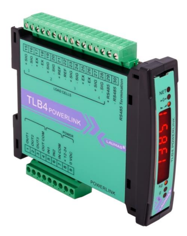
Figure 9 TLB4 indicator - sub model TLB4 POWERLINK