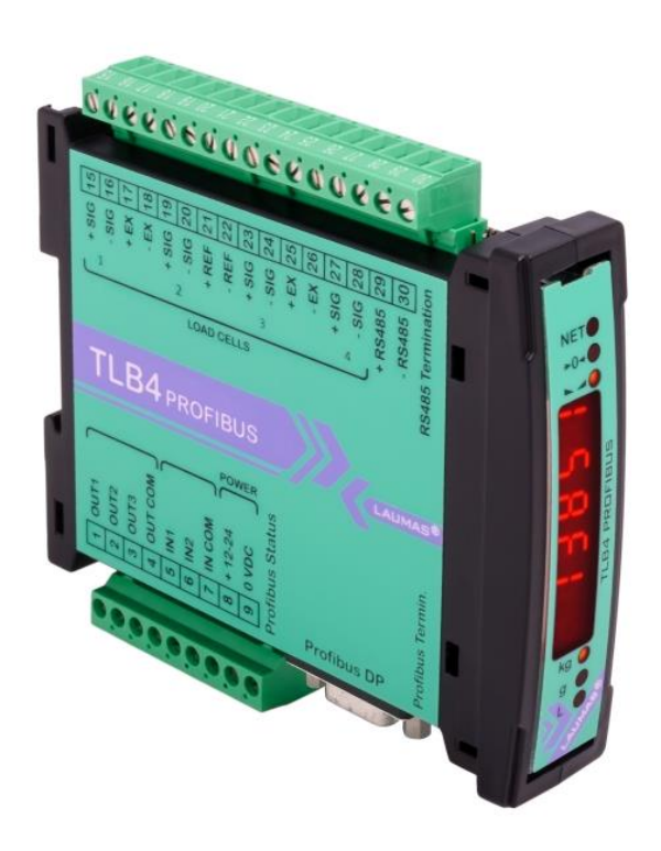
Figure 10 TLB4 indicator - sub model TLB4 PROFIBUS