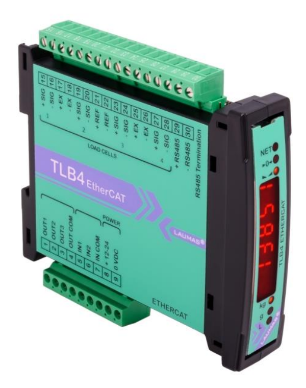
Figure 5 TLB4 indicator – sub model TLB4 EtherCAT.