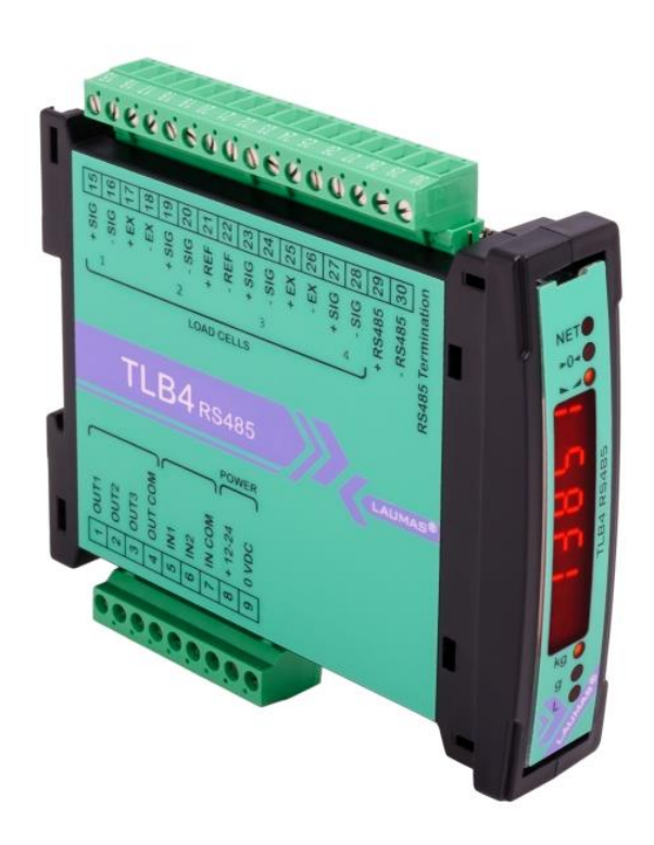
Figure 12 TLB4 indicator – sub model TLB4 RS485