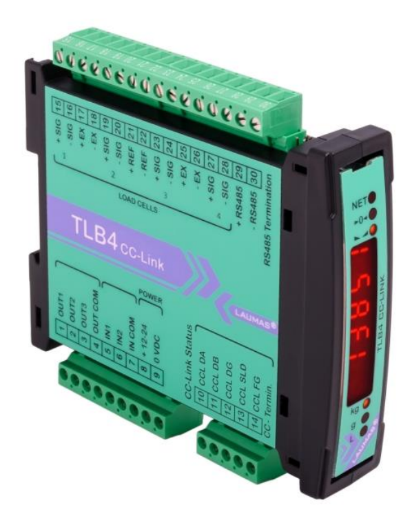
Figure 3 TLB4 indicator – sub model TLB4 CC-Link.