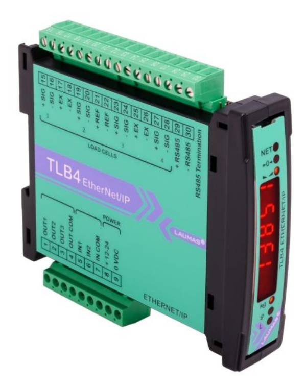
Figure 7 TLB4 indicator - sub model TLB4 EtherNet/IP