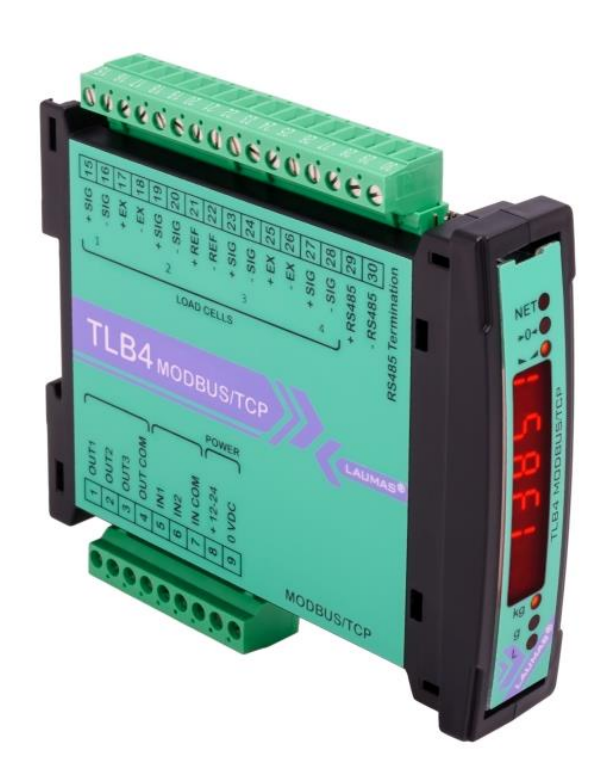
Figure 8 TLB4 indicator – sub model TLB4 MODBUS/TCP